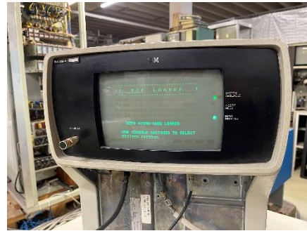
Success – diagnostic loaded!